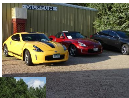
Comanche Museum, Strasburg, CO