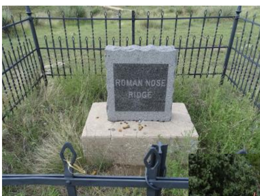
Roman Nose Ridge