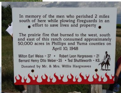
Memorial to the men who perished fighting a prairie fire