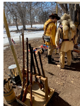
Two trappers shopping for muskets