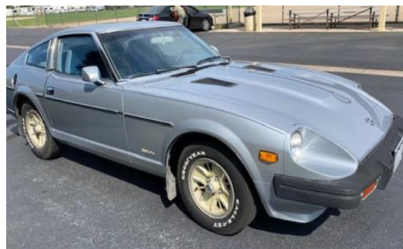
Passenger Side View