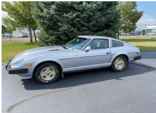
Drivers side view

Please call Tamra at 720.240.8944. linebergers@comcast.net