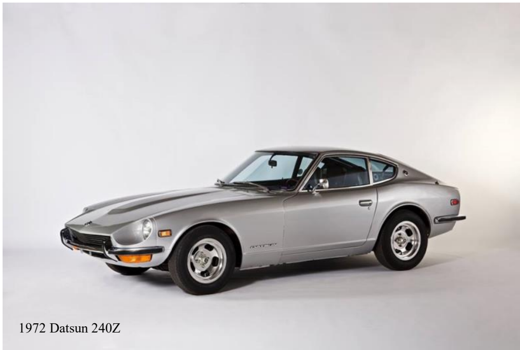
1972 Datsun 240Z

Between racers, tuners, and rust, a lot of these cars are no longer with us. But since Nissan sold nearly 150,000 of them in the U.S., there are still a lot left to choose from and values look to have hit their ceiling. With the market for Japanese performance cars generally looking to have a bright future, though, it's reasonable to expect that the values for these cars that got that segment rolling back in the '70s will remain strong.