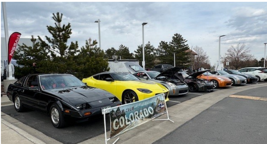
Empire Car Show 3/30/2024

I look forward to seeing members at the many events that are being hosted this summer. From drives to the auto cross to barbecues and lots of car shows. It seems we have a little bit of everything so members will be busy this summer. See you in person in May at Gateway for our general meeting!