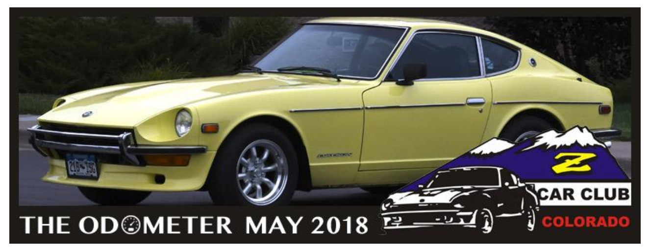
Colorado's Meeting Place for All Datsun/Nissan Enthusiasts