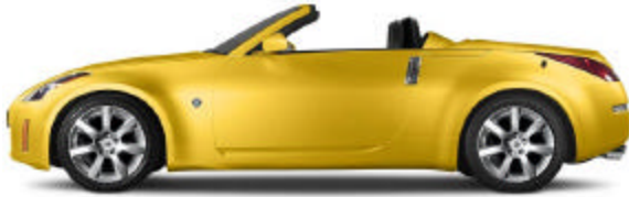
005 Ultra-Yellow 350Z Touring Roadster, 1 st in state, wont last!

Tynan Town's Ads "Offering $1000 off retail price on any 350Z in stock." To view Zs for sale in color, go to www.zccc.org , and click Odometer (Note. You must have Adobe reader).