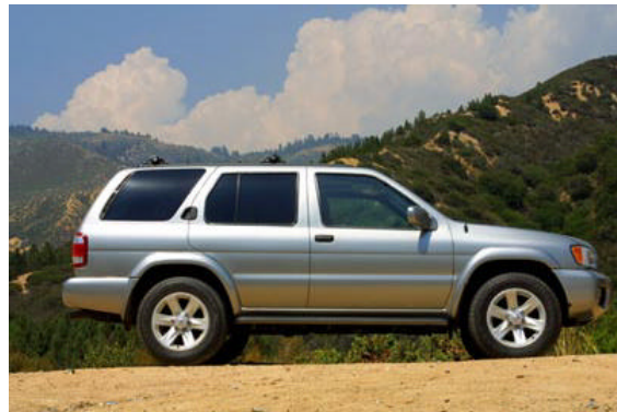
2004 Nissan Pathfinder 4x4 Sale, $7500 off MSRP, No Payments 'Til 2005, Stock # 44563, 44603, 44630, 44587, Dealer retains rebate, includes $500 Tynan's loyalty bonus, $35,597 - $7500 = $28,097