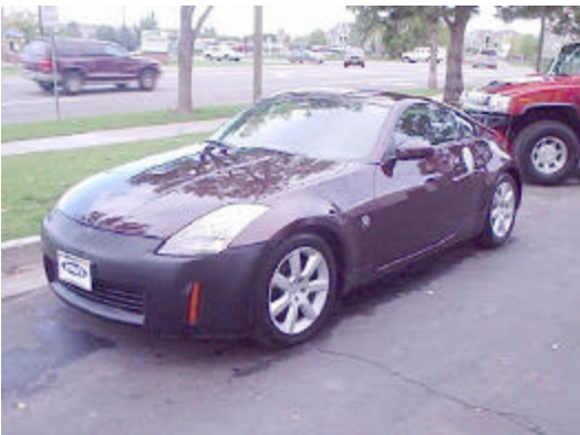
2003 350Z, brown, 10,558 miles, $27,995