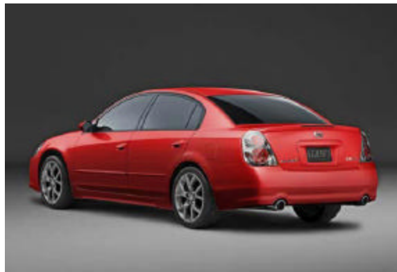
2005 Nissan Altima 2.5S, Lease for only $147/mo, Stk# 57652, 57666, 57669, 57578 42 mo. Lease, $1999 Cap Reduction, 12k/yr WAC, Includes $500 loyalty bonus