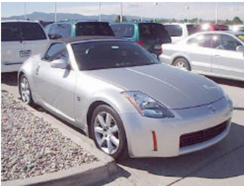
2004 Roadster, silver, 8,483 miles, $32,900 (price reduced)