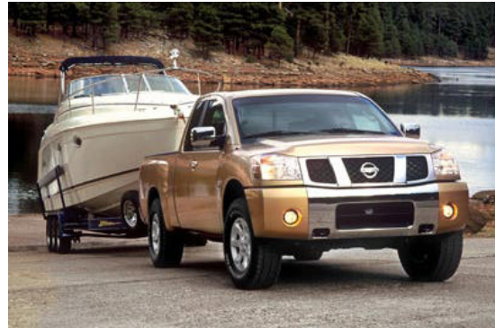
Sale on 2004 Nissan Titan Crewcab 4x4 Sale, $7500 off MSRP, No Payments 'Til 2005, Stk # 4872, 48735, 48709, 48706, Dealer retains rebate, includes $500 Tynan's loyalty bonus, $42,960 - $7500 = $35,460