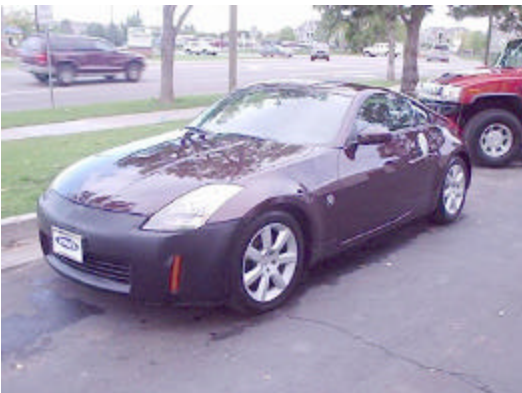
2003 350Z, brown, 10,558 miles, $27,995